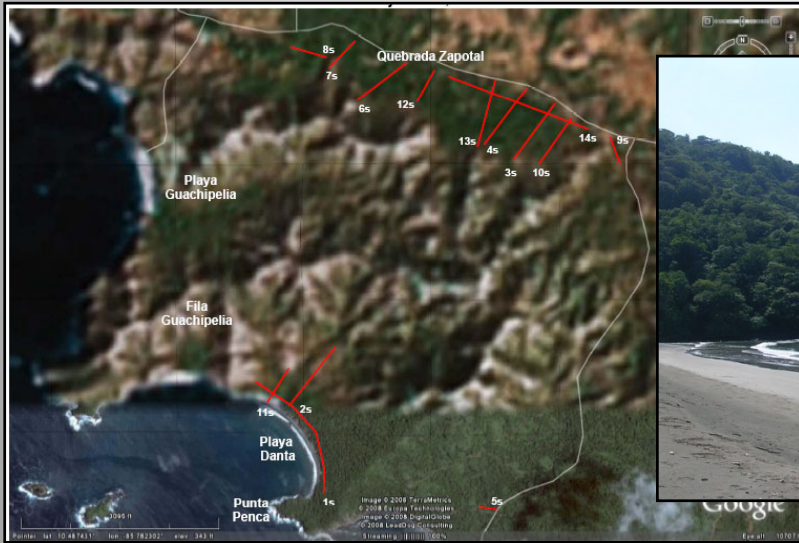
Locations of MER Transects Across the Project Site